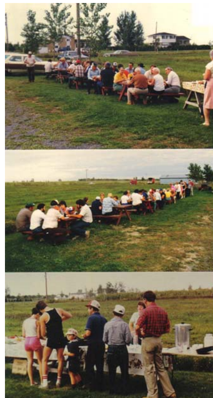
C a s s e l m a n 1 9 8 5