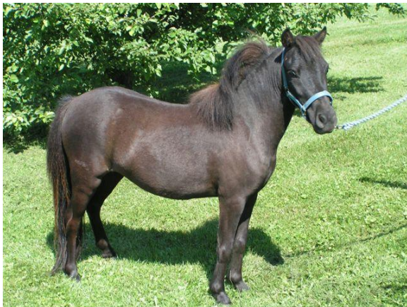
One of the Miniatures Mary Hume & Walter Hambleton took to The Horse Exhibit at the Museum of Civilization for a popular hands-on exhibit

We arranged to meet with her to discuss a possible Miniature Horse display and, having ironed out the insurance and containment aspects, we were invited to present our horses for two days in June and another two in July.