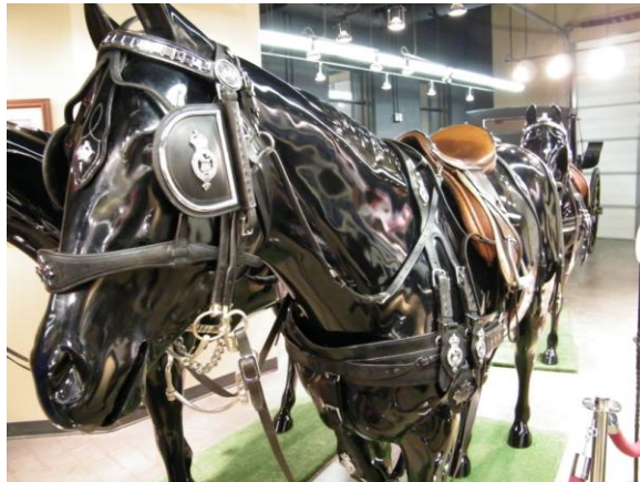
Exhibit of postillion harness and horses put to the landau in the Visitor's Centre.