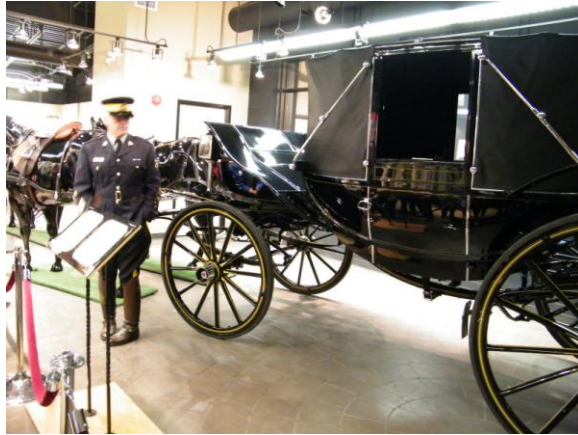
RCMP landau on display in the Visitor's Centre.

rider would handle both his own horse's reins plus the rein from the off horse.