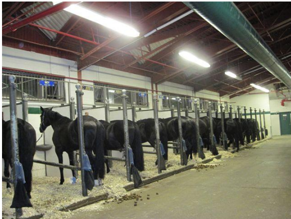
Some of the RCMP school horses used to train the new recruits.

The Musical Ride horses had just returned home so we had a full complement of 96 horses grouped into three categories to view – the Musical Ride horses, young horses in training, and the stalwart school horses on whom the new recruits train. The breeding stock – stallions, broodmares, foals, yearlings and two-year-olds – all reside at the RCMP farm at Pakenham just west of Ottawa.